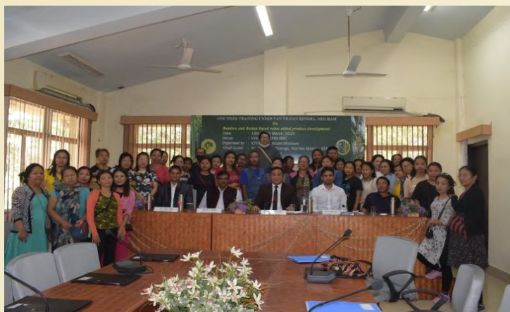
ICFRE-BRC, Aizawl, Mizoram organized training on Bamboo and Rattan based value added product development