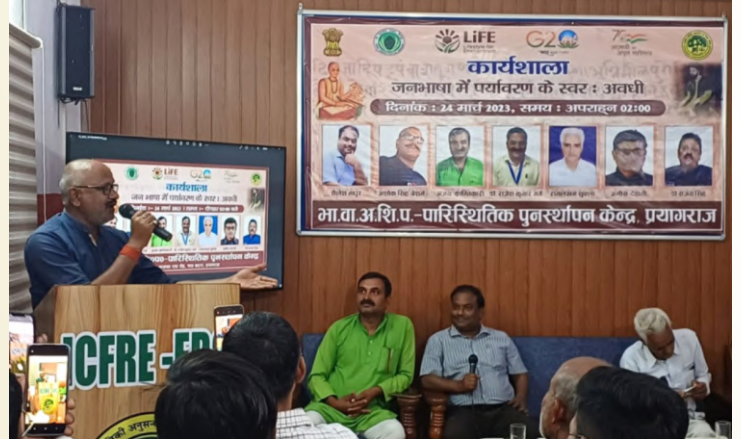
A one day workshop and poetry recitation was organized by the ICFRE-Eco-Rehabilitation Centre, Prayagraj on the topic “Jan Bhasha me Paryavaran Ke Swar : Awadhi”