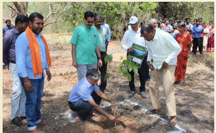
ICFRE-IFGTB, Coimbatore organized a sensitization programme on LIFE (Lifestyle for Environment)