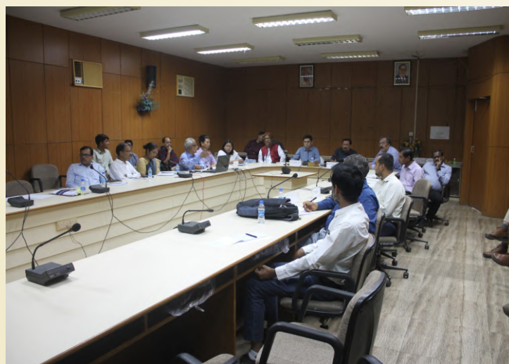
ICFRE-AFRI, Jodhpur conducted Workshop on HRRL funded project- greenbelt development