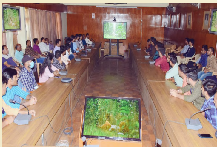
ICFRE-IWST, Bengaluru celebrated World Wildlife day