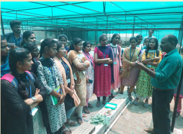
Students of Botany from PSG College of Arts & Science, Coimbatore visited ICFRE-IFGTB, Coimbatore