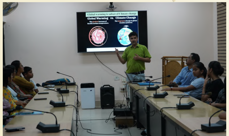
ICFRE-RFRI, Jorhat organized a sensitization programme on LiFE (Lifestyle for Environment)