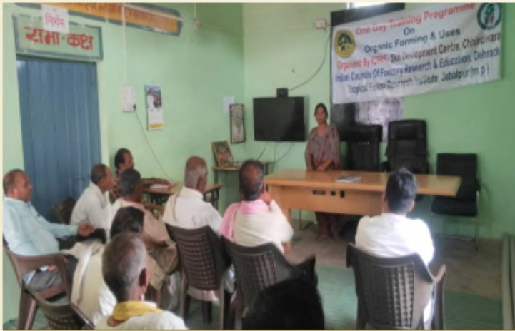
ICFRE–FRCSD, Chhindwara conducted training cum awareness programme on Method for preparation of Organic Manure