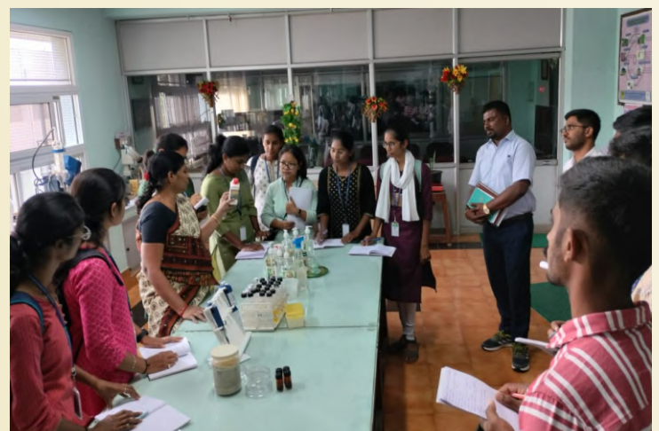
M.Sc (Forestry) students from College of Forestry, Ponnampet, Karnataka visited ICFRE-IFGTB, Coimbatore