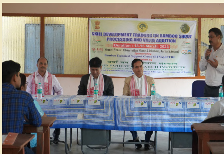
Training on Bamboo Shoot Processing and Value Addition, Lichubari Assam