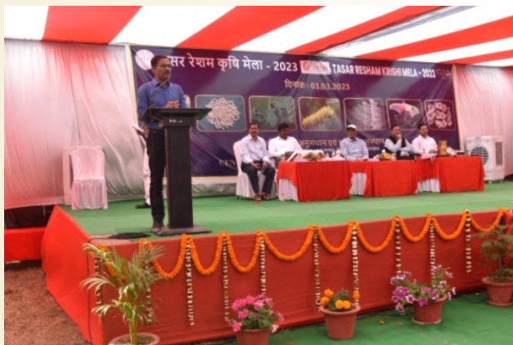
ICFRE-IFP, Ranchi participated in one day Tasar cum Silk-Kisan Mela 2023 organized by CTRTI, Nagri, Ranchi