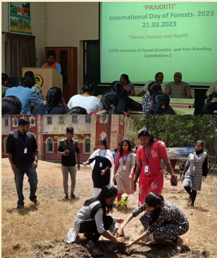
ICFRE-IFGTB, Coimbatore celebrated International Day of Forests 2023 by organizing Tree Sapling Planting Programme followed by lectures under the theme Forest and Health