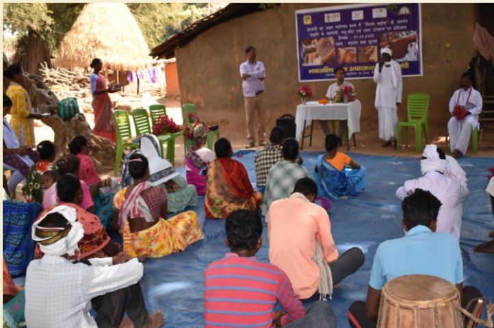
ICFRE-IFP, Ranchi conducted training programme on Nature's Helper-Honeybees and Honey Production