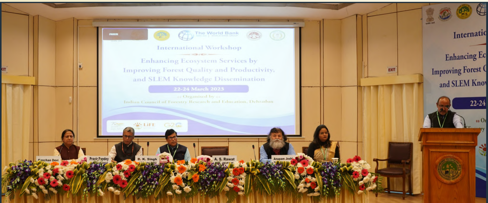
ICFRE, Dehradun conducted International Workshop on Enhancing Ecosystem Services by Improving Forest Quality & Productivity and SLEM Knowledge Dissemination

ICFRE, Dehradun conducted International Workshop on Enhancing Ecosystem Services by Improving Forest Quality & Productivity and SLEM Knowledge Dissemination from 22 to 24 March 2023. 200 delegates from National and International research organization from Bangladesh, Bhutan, Japan, Malaysia, Nepal and Thailand, Universities, SFDs, representatives from World Bank, FAO, GIZ, UNDP, ICFRE DDGs, ADGs, Directors from Institutes, scientists & officers participated in the workshop.