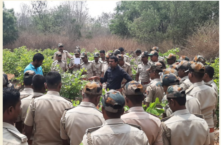
ICFRE- IFB, Hyderabad conducted a programme on botanizing the ICFRE-IFB campus