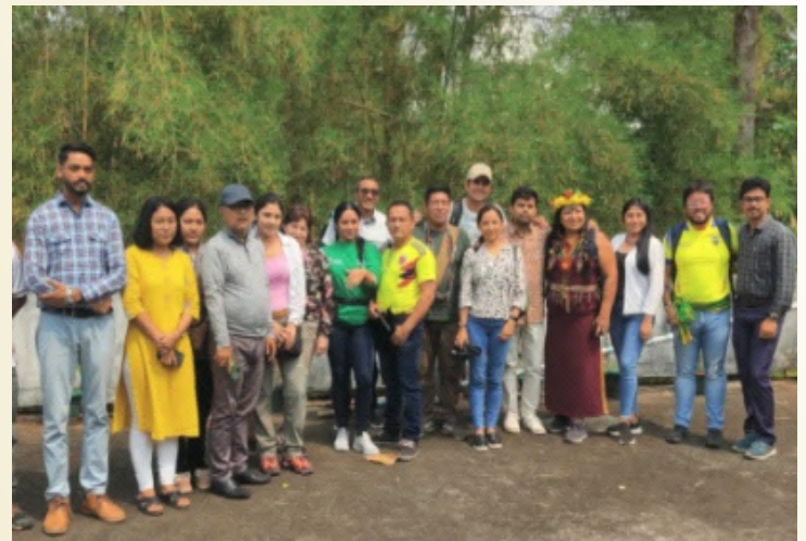
15 members from Latin America, Brazil and UK visited ICFRE-LEC, Agartala

15 members from Latin America, Brazil and UK visited ICFRE-LEC, Agartala on 18 March 2023.