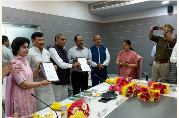
MoU was signed between ICFRE-FRI, Dehradun and Uttar Pradesh Forest Department on Genetic improvements of Azadirachta indica