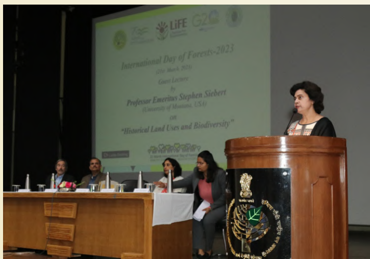
ICFRE-FRI, Dehradun celebrated International Day of Forests