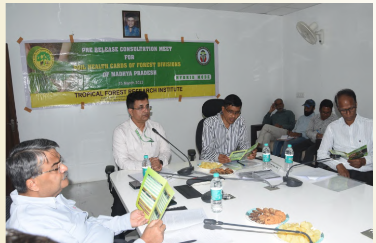
ICFRE-TFRI, Jabalpur organized Pre-consultation meeting for Soil health cards of forest divisions of M.P.