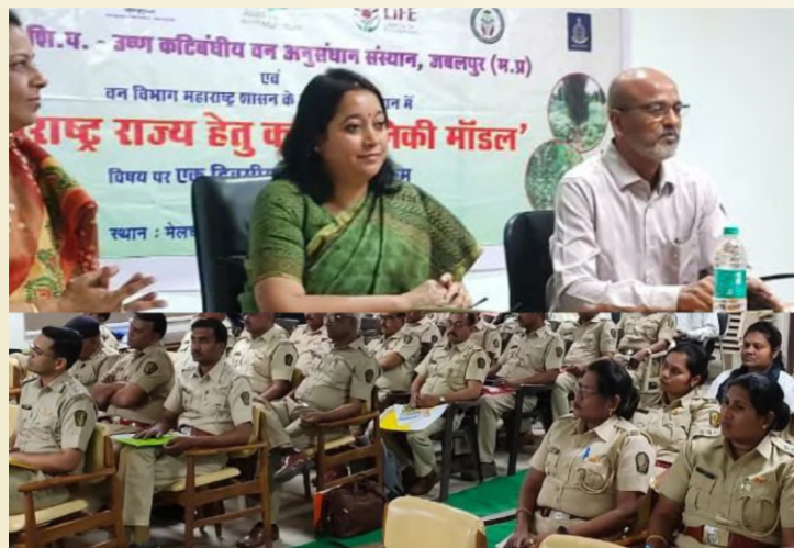
Training on Agroforestry Models for Maharashtra region