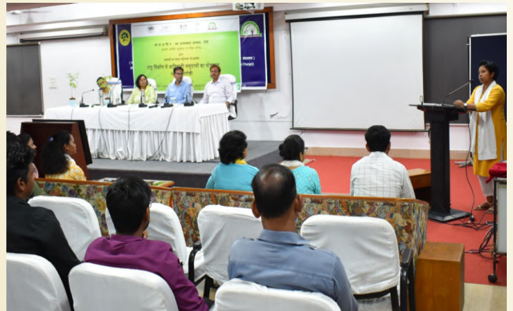
ICFRE-IFP, Ranchi organized a seminar on contribution of tribal communities in nation building