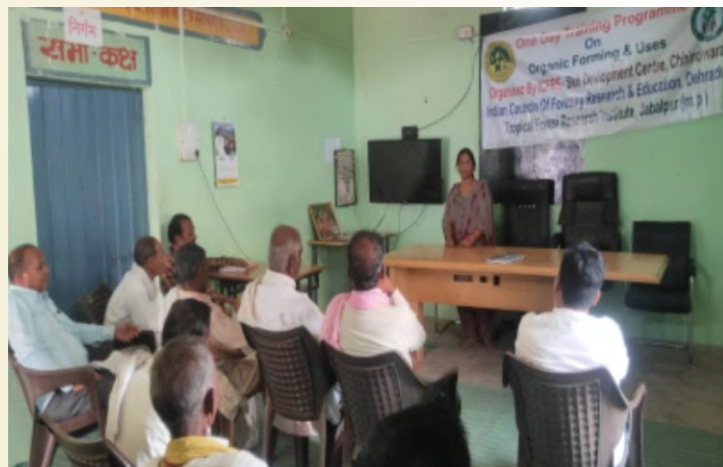
Training on Method for preparation of Organic Manure, Chhindwara