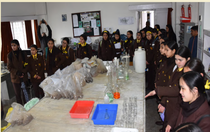
ICFRE-HFRI, Shimla celebrated International Day of Forest under the theme Forests and Health