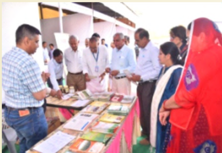
ICFRE-AFRI, Jodhpur organized Tree Grower's Mela