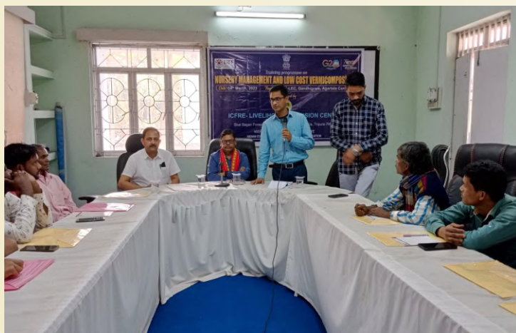
Skill Development training on Bamboo Utility Products, West Tripura district

23. Method for preparation of Organic Manure 10 March 2023 27 Farmers from Maniyakhapa, Chhindwara