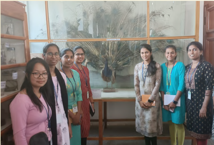
Students from College of Forestry, Ponnampet, Kodagu, Karnataka visited Gass Forest Museum of ICFRE-IFGTB, Coimbatore