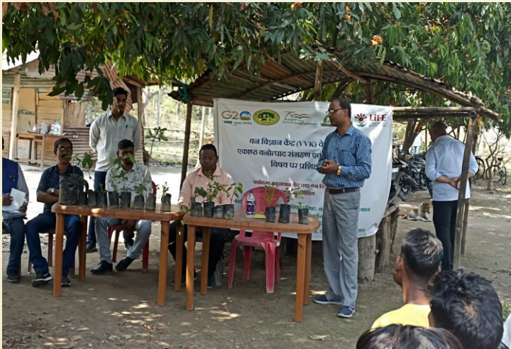
ICFRE-IFP, Ranchi's Research Station ERS and VVK, Sukna, Darjeeling organized a training programme on Non-Timber Forest Produce Collection and Value addition