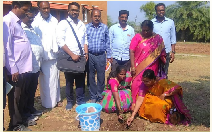
Training on Sandalwood based on Agroforestry Models