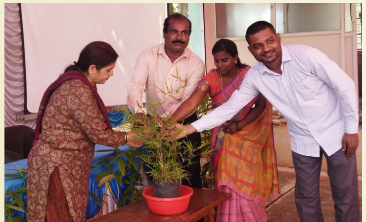
Training on Bamboo cultivation, Seasoning and Preservation