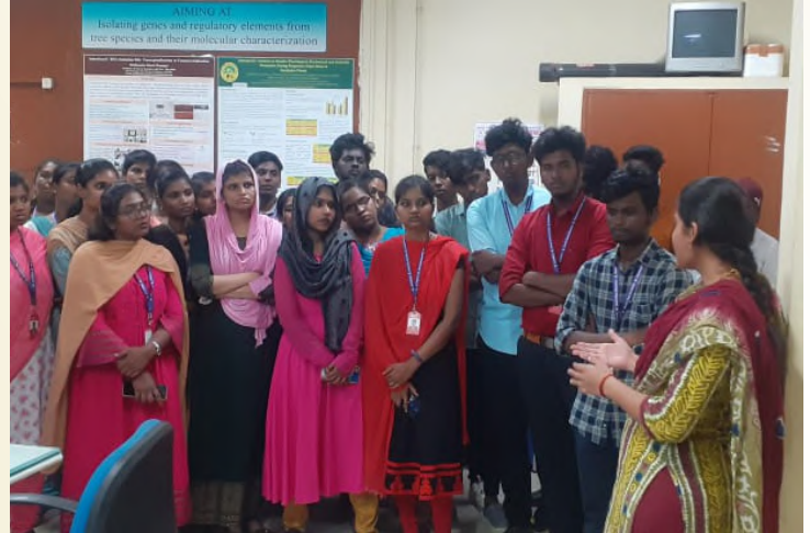
B.Sc (Biotechnology) students from Achariya Arts and Science College, Villianur, Puducherry U.T. visited ICFRE-IFGTB, Coimbatore