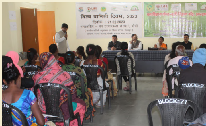
ICFRE-IFP, Ranchi in collaboration with KVK, Balumath, Latehar organized a training programme on Lac production & Processing