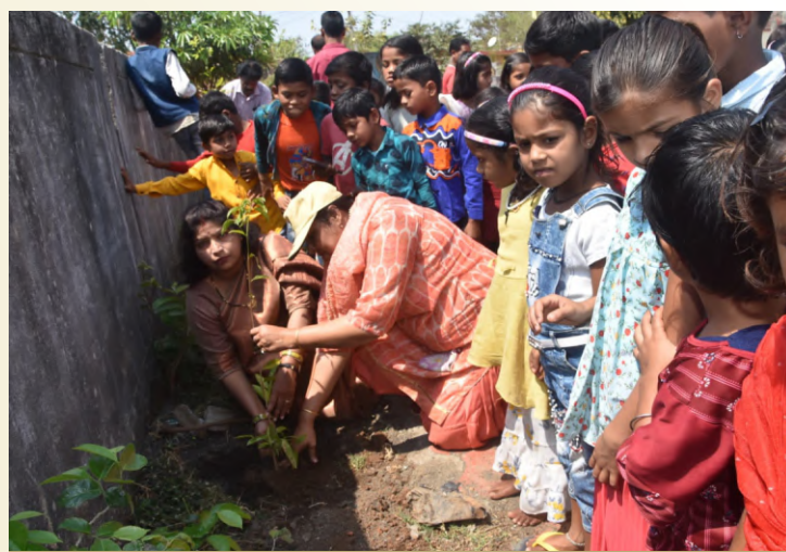
ICFRE-TFRI, Jabalpur celebrated International Day of Forests