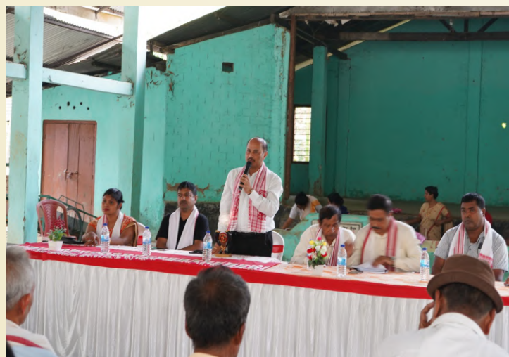
ICFRE-RFRI, Jorhat conducted Brainstorming session for Livelihood Generation using different technology of ICFRE-RFRI, Jorhat