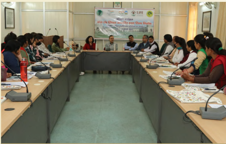
Training on Making Bamboo and Ringal Handicrafts