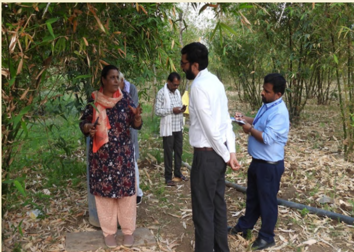
ICFRE-TFRI, Jabalpur demonstrated bamboo based agroforestry system established in the farmers field, Patan to the team of NABARD officials