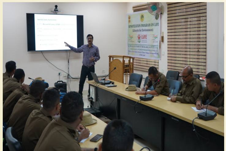
Trainees from Assam Forest Guard School, Makum, Assam participated in various Research and development activities of RFRI, Jorhat

Five students from Joyasagar College, Sivasagar, Assam, 38 Trainees from Assam Forest Guard School, Makum, Assam and 15 Bamboo Artisans from Ankur Bah Shilpa Udyog, Kukrapohi Augiri Gaon, Jorhat participated in ICFRE-RFRI, Jorhat's Research and development activities, Bamboo Cultivation, Propagation, Nursery Management, Value addition & Bamboo Preservation Techniques, Biotechnology and Tissue Culture, VPI Unit, Banh Bithika, Lac Cultivation, Botanical Garden, Orchidarium, Vermicomposting etc on 14, 30 and 31 March 2023.