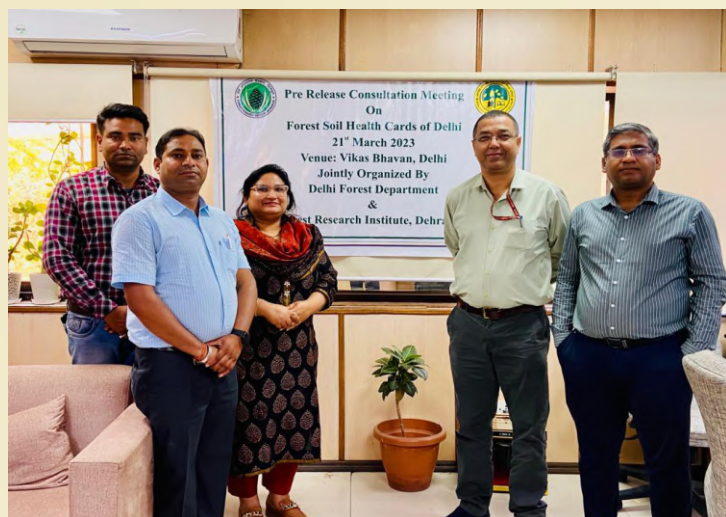
FRI, Dehradun conducted Pre consultation meeting on Forest Soil Health Cards