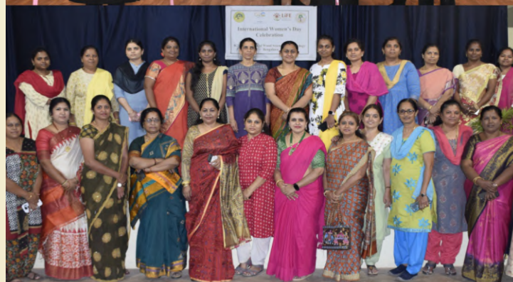
ICFRE-IWST, Bengaluru and ICFRE-IFGTB, Coimbatore celebrated International Women's Day 2023