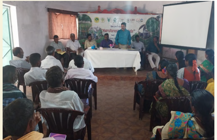
ICFRE-IFGTB, Coimbatore organized one day training programme on Agroforestry Models