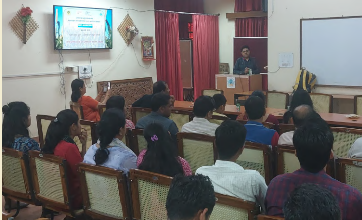
ICFRE-AFRI, Jodhpur conducted programme on Women Entrepreneur under the theme “Aatma Nirbhar Bharat”