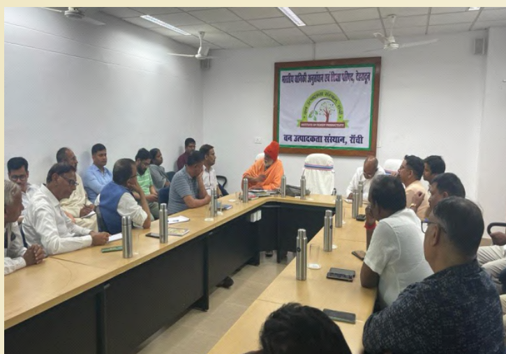
ICFRE-IFP, Ranchi conducted Meeting on Combating land degradation, increasing green cover and enhancing land based livelihoods in Jharkhand