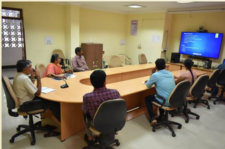
ICFRE-IFGTB, Coimbatore organized meeting on Forest Soil Health Cards of Puducherry UT