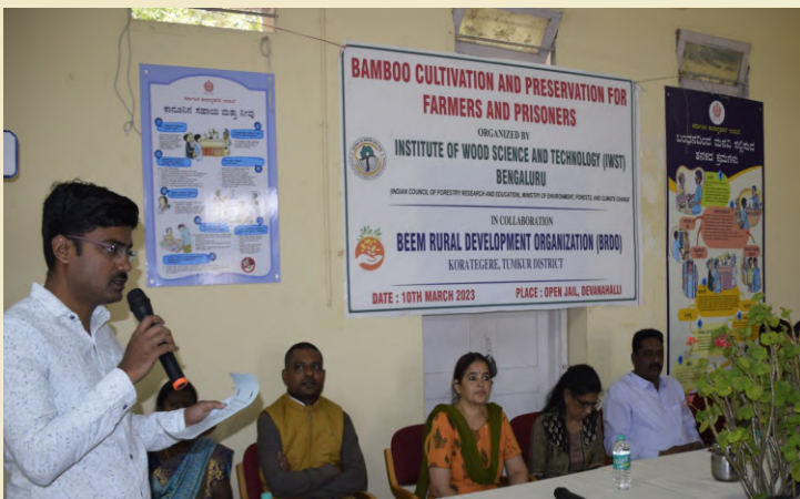
Training on Bamboo cultivation, Seasoning and Preservation