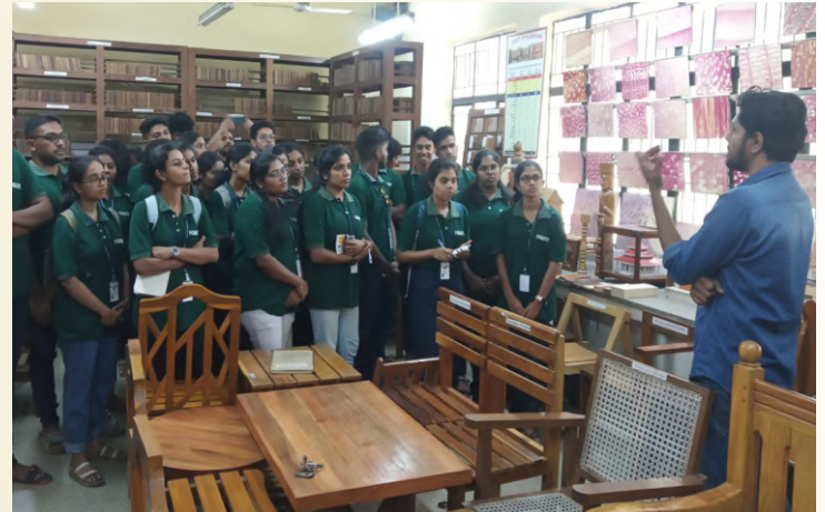
B.Sc., students with faculty from Kerala Agricultural University, College of Forestry, Trissur, Kerala visited ICFRE-IWST, Bengaluru