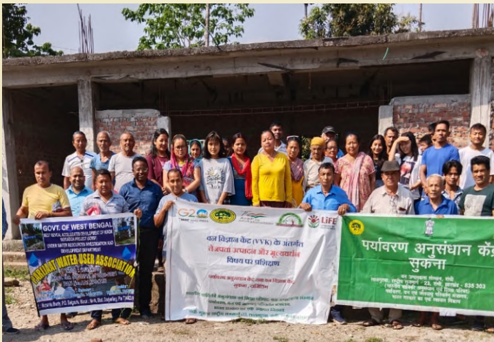
ICFRE-IFP, Ranchi's research station ERS and VVK, Sukna, Darjeeling organized a training programme on Production of Cinnamomum tamala and its value addition