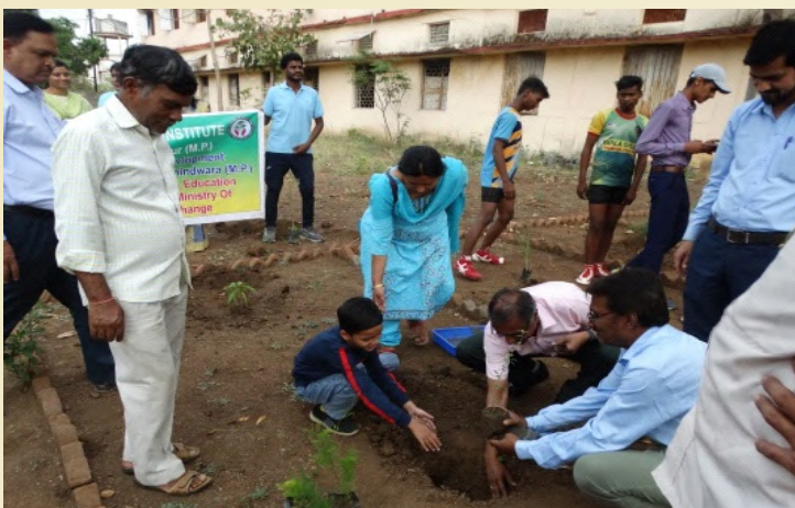
ICFRE–FRCSD, Chhindwara organized Swatchhata Abhiyan