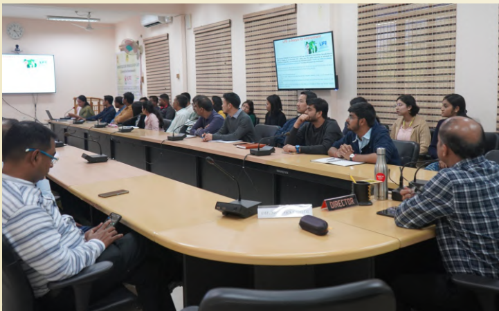
ICFRE-RFRI, Jorhat organized a seminar on Healthy Lifestyle and a presentation on Rebooting for Life: Eating for Healthy Body and Healthy Planet