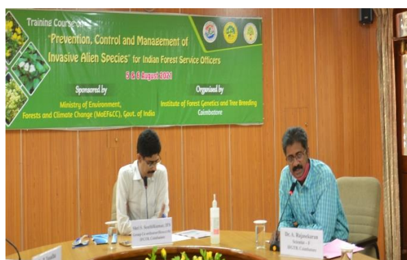
A view of Valedictory session