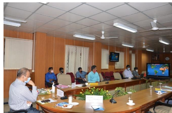
A view of Video session