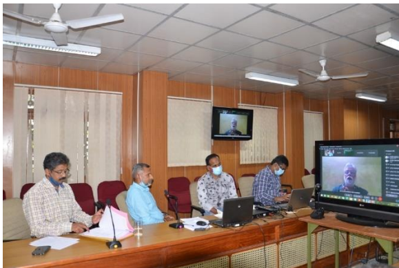
Online interaction during the lecture