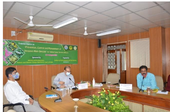
Experiences sharing session