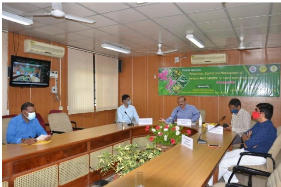
A view of Panel discussion