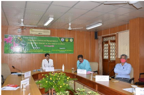
Address by Training Coordinator, IFGTB