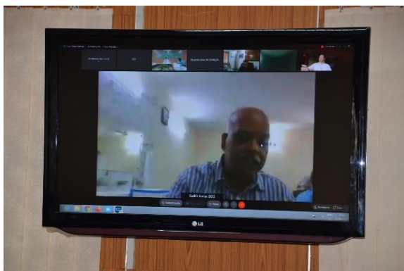
Inaugural Address by DDG (Extension), ICFRE