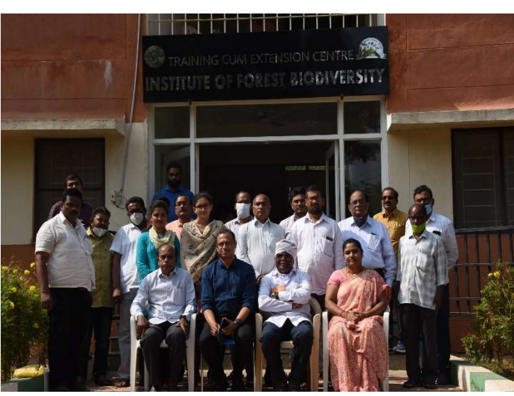
Training program group photograph at IFB