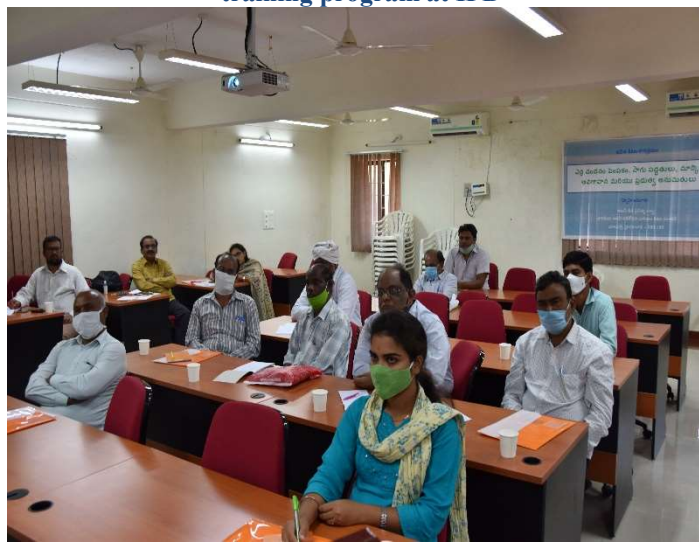
Classroom Session for farmers at IFB