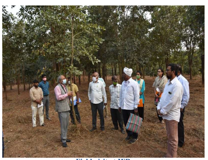
Field visit at IFB