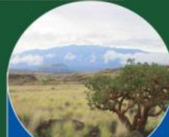
Restore Degraded Areas