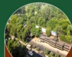
Green Urban Areas