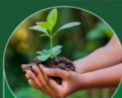
Protect Natural Areas