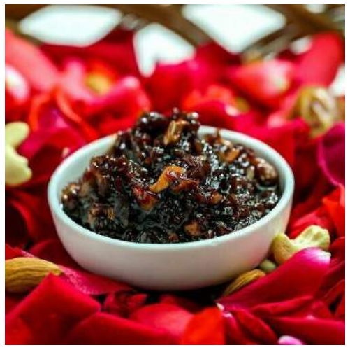
Fig 14: Gulkand

Preserving rose petals in sugar is known as Gulkand. It is prepared by mixing rose petals and sugar in the ratio of 1:1. Gulkand is an ayurvedic tonic. Its benefit includes reduction in eye inflammation and redness, strengthening of the teeth and gums, and the treatment of acidity. Gulkand has cooling properties, thus it is beneficial in alleviating all heat related problems like tiredness, lethargy, itching, aches and pains. It also helps in reducing burning sensations in the soles and palms.