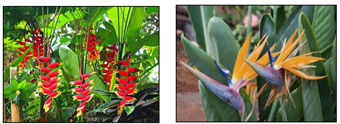
Fig 8: Heliconia and Bird of Paradise as Speciality flowers

Paradise, Lilium, Acacia, Rice flower, Wax Flower, Gypsophila and Statice comes under the category of specialty flowers. Specialty cut flowers are a niche product for small and medium sized farmers with limited resources who mainly sell at local markets. Specialty flowers have a huge potential to increase income for both small and large farmers. The demand of specialty flowers has increased due to increase in globalization. Change in living standard, customers demand for new flowers and liberalization of industrial and trade policies. The advantage of growing specialty flowers new colours, forms, long stem, good vase life and high production per square foot etc.