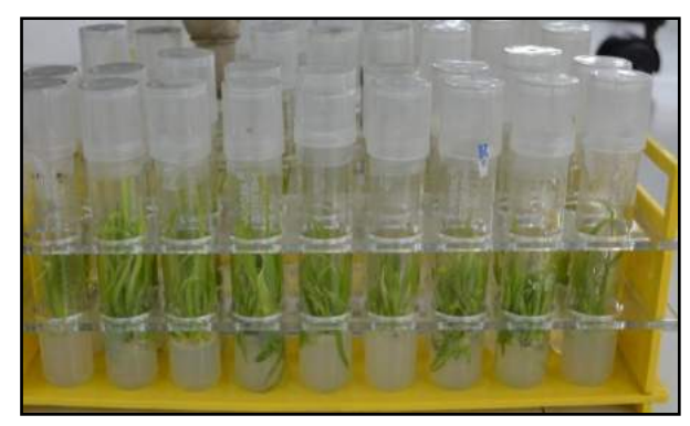
Fig 11: Tissue cultured plants

Plant tissue culture has a great impact on both agriculture and industry, through providing plants needed to meet the ever increasing world demand. It has made significant contributions to the advancement of agricultural sciences in recent times and today they constitute an indispensable tool in modern agriculture. Commercial tissue culture was born in India in 1987 when A.V. Thomas and Company Kerala (AVT) established their first production unit in Cochin for clonal propagation of superior genotypes of selected cardamom plants. Plant tissue culture activities in India are at present confined to production of ornamental and flowering plants, which have a large global export market. Demand for flowers is increasing globally. India is expected to emerge as a strong player in the consumer market of biotechnology products in the coming years. In India there are more than 90 tissue culture units producing mostly foliage and flowering potted plants. Our tissue culture laboratories can produce wide range of bulbs in micro propagation way and that can be bulked in the fields of cold climate areas like Kashmir in economical way. Also there is good possibility to export mini bulbs to European countries.