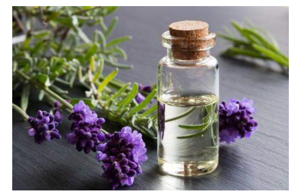
Fig 6: Essential oil

Essential oils are one of the most valuable products that are being used mankind since ages. Essential oils are highly concentrated substances extracted from various parts of aromatic plants and trees. It is derived from the word essence that refers to the distinct scent of the plant. It is life-blood of the plant, protecting it from bacterial and viral infections. The use of essential oils for therapeutic, spiritual, hygienic and ritualistic purposes goes back to a number of ancient civilizations including the Chinese, Indians, Egyptians, Greeks, and Romans who used them in cosmetics. perfumes and drugs. India has rich biodiversity in many essential oil plant species. But, it is mainly concentrated on rose and jasmine for essential oil extraction. The major flower crops important for essential oil extraction include rose, jasmine, tuberose, vanilla etc. Brazil, China, USA, Egypt, India, Mexico, Guatemala and Indonesia are the major producers of essential oils. The major consumers are the USA (40%), Western Europe (30%) and Japan (7%).