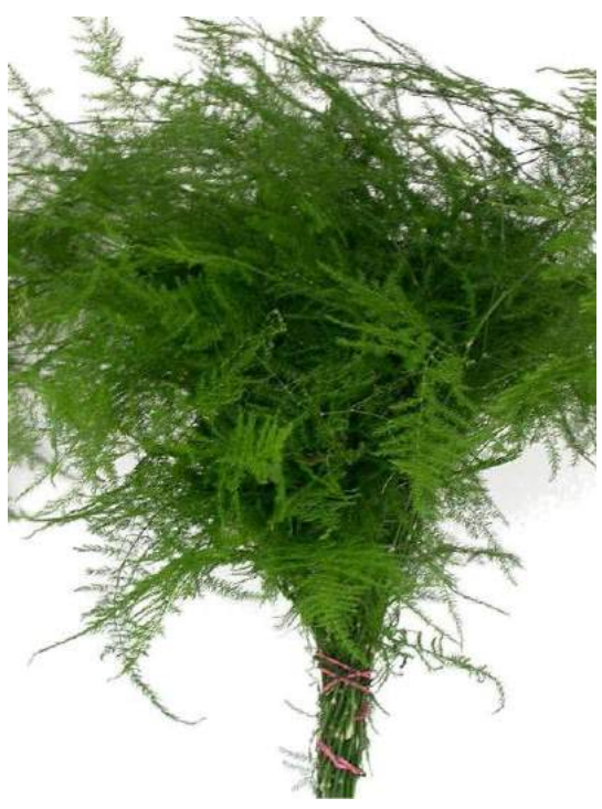
Fig 3: Cut greens