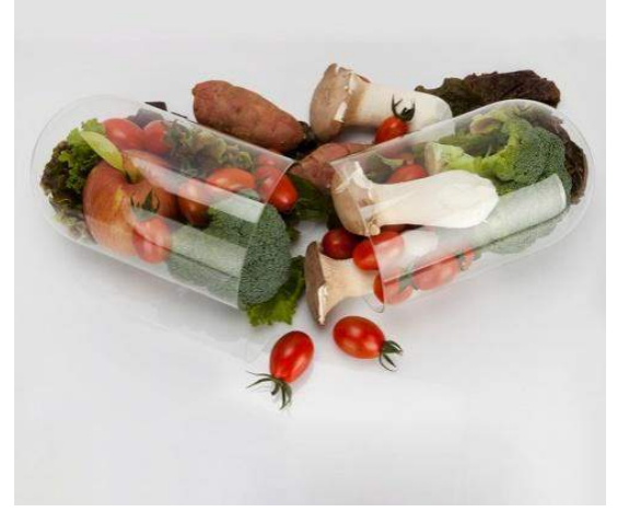
Fig 9: Nutraceuticals Aromatherapy

nutraceuticals is a highly desirable objective to improve the health of the people of the country, especially that of the poor people. Now, the nutraceuticals related research for improving its quality and quantity is an important area for ongoing biotechnological investigations.