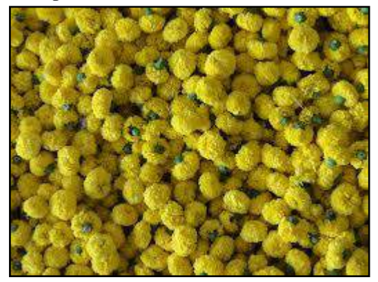
Fig 2: Marigold as loose flowers Cut greens

wholesalers, retailers and the consumers. A small portion of loose flowers is being exported to Middle East, UK and USA for the expatriate Indians.