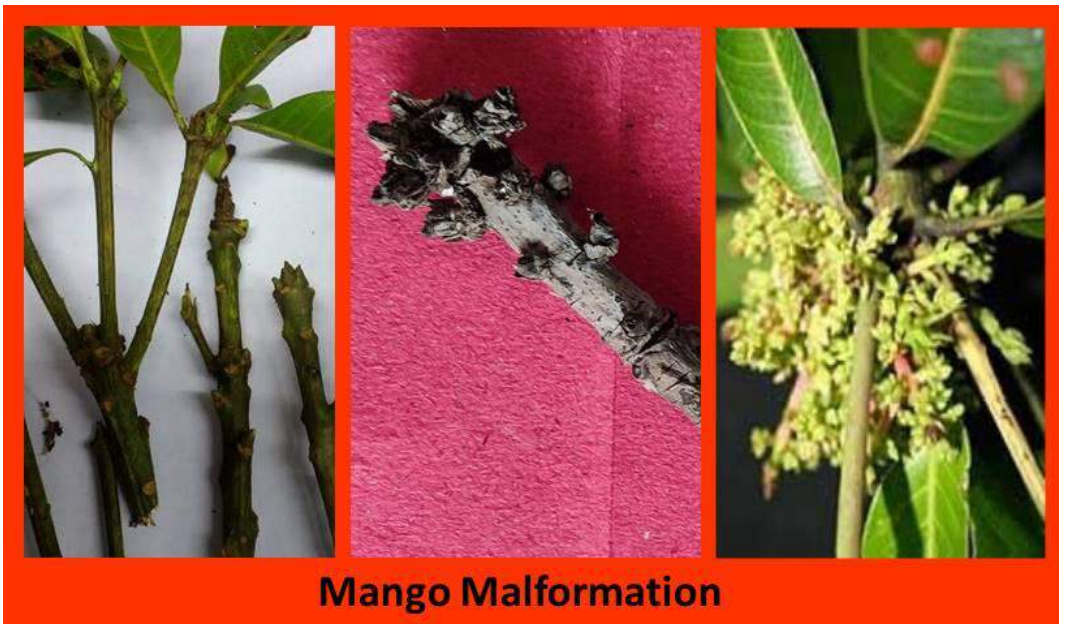
© Published by Tropical Forest Research Institute, Jabalpur, MP, India

proved to be the main reason for handling problem. particular So cultural this management include mango as we know that there is no definite control measures for this particular malformation of mango so control includes the following measures malformation for mango medicine. Avoiding scion stick from trees wearing malformed inflorescence for propagation is one of the most important cultural practices that need to be adopted. Then we can go for using certified saplings for propagation which ensures that there are no malformed seedlings are coming to the orchard and as soon as the disease symptoms are well expressed the affected terminals should be pruned along with a healthy portion of approximately 15 to 20 centimeter. So this is the most widely recommended and practiced cultural practice where the malformed tissues are cut out along with a portion of healthy tissues so that the inoculum or the causal agent that forms the mango malformation are completely wiped out from the existing plant.