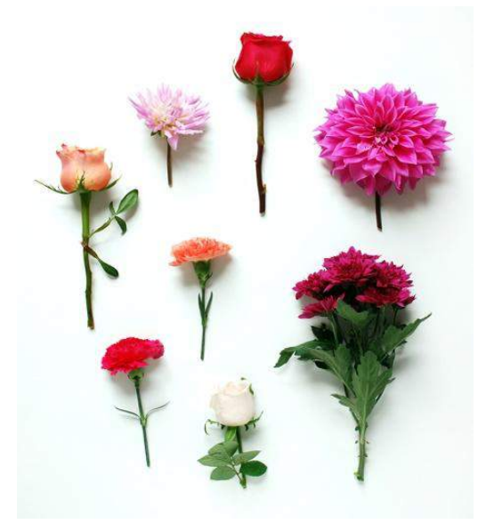
Fig 1: Cut flowers

double flower varieties are equally popular. Tuberose flowers are also sold loose in some areas for preparing garlands and wreaths. The other main cut flowers include Asters. Gerbera. Carnation. Anthodium, Lilium, and Orchid. Production of Orchids is restricted mainly in the north-eastern hill regions, besides parts of the southern states of Kerala and Karnataka.