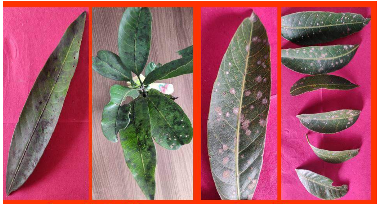
Sooty Mold of Mango

The disease causes infection on leaves thus leads to the reduction in photosynthetic activity and defoliation of leaves and thereby reducing the vitality of the host plant. The disease is marked by the presence of the rusty red spots mainly on leaves and sometimes on petioles and bark of young twigs. . These spots are greenish grey in colour and velvety in texture which later turn into reddish brown. The circular and slightly elevated spots sometimes coalesce to form larger and irregular spots. The fungus also causes infection on stem and the affected portion of stem cracks. In case of severe infection, the bark becomes thick, twigs get enlarged but remain stunted and the foliage finally dries up. three Two to sprays of Copper Oxychloride (0.3%) should be used for controlling the disease.