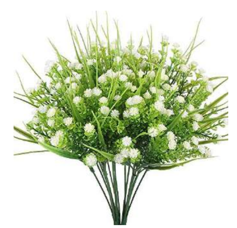
Fig 12: Fillers used in bouquet Value added products

Value added Floriculture is a process of increasing the economic value and consumer appeal of a floricultural commodity. Value-addition ensures high premium to the grower while providing more acceptable quality products for the domestic and export market. A number of value added floricultural products are marketed in the domestic and international market which are given below.