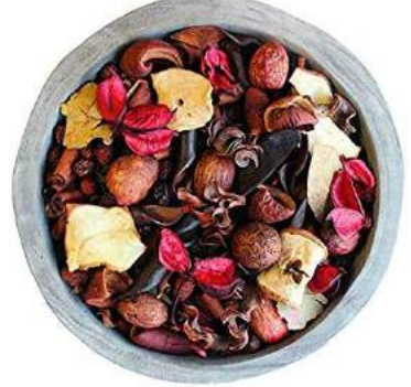
Fig 13: Pot pourri nas opened up the avenue CPublished by Tropical Forest Research Institute, Jabalpur, MP, India

Pot pourri is a mixture of dried, sweetscented plant parts which includes flowers, leaves, seeds, stems and roots. Naturally scented plants used in traditional potpourri include rose flowers, hips or oils, rosemary leaves and flowers, orange peels, lemon peel, mint leaves and flowers, jasmine flower and oil, fennel seed, cloves, cedar wood shavings, jujube flowers and blooms, lavender flowers and leaves, cinnamon bark and cassia bark.