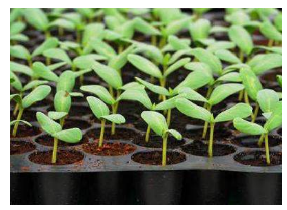
Fig 10: Plug plant production Plant tissue culture

Plant tissue culture has a great impact on both agriculture and industry, through providing plants needed to meet the ever increasing world demand. It has made significant contributions to the advancement of agricultural sciences in recent times and today they constitute an indispensable tool in modern agriculture. Commercial tissue culture was born in India in 1987 when A.V. Thomas and Company Kerala (AVT) established their first production unit in Cochin for clonal propagation of superior genotypes of selected cardamom plants. Plant tissue culture activities in India are at present confined to production of ornamental and flowering plants, which have a large global export market. Demand for flowers is increasing globally. India is expected to emerge as a strong player in the consumer market of biotechnology products in the coming years. In India there are more than 90 tissue culture units producing mostly foliage and flowering potted plants. Our tissue culture laboratories can produce wide range of bulbs in micro propagation way and that can be bulked in the fields of cold climate areas like Kashmir in economical way. Also there is good possibility to export mini bulbs to European countries.