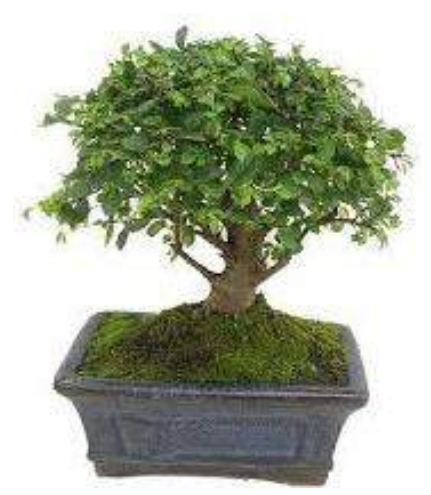
Fig 7: Bonsai

Specialty flowers : Specialty flowers are the cut flowers, which are not widely known and also grown in small pockets but have high prospects in the international market. These are a high value crops and are cut flower species other than major cut flowers. Heliconia, Red Ginger, Bird of