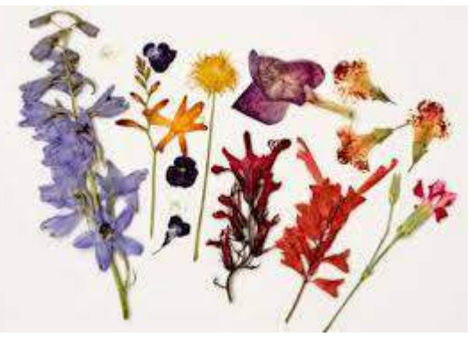
Fig 4: Dry flowers

Spain are leading importers country. In India flower export has increased after liberalized EXIM policy. The contribution of dried ornamentals in total export is about 71% at present. The main exporting material from India includes lotus pods, dried flowers of camellia, dahlia, marigold, wood rose, wild lilies, paper flower and naturally dried plant parts from Himalayan region.