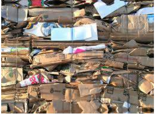
Paper and cardboard are easy replacements