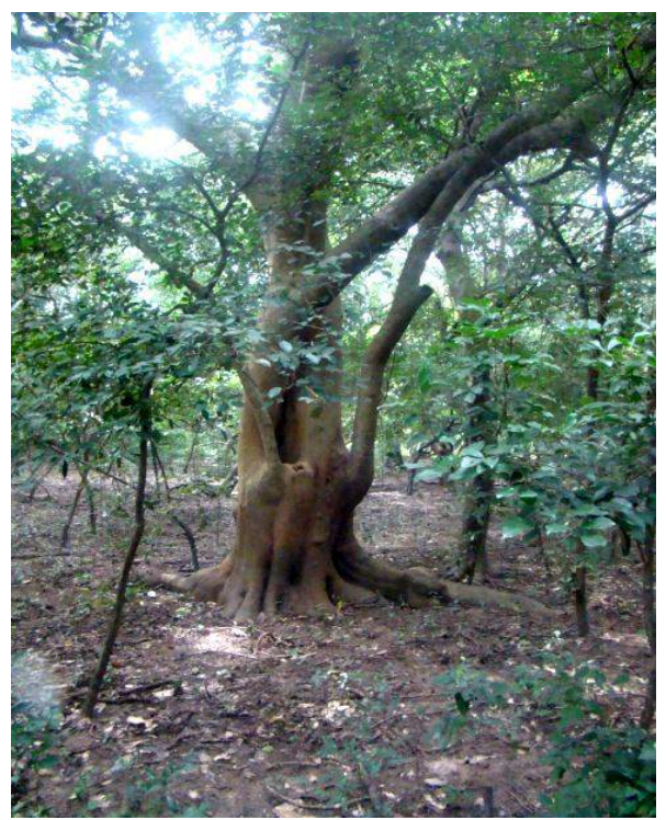
Fig. 2. S. nux-vomica tree in Bhitarkanika island

35-45 Celsius of maximum temperature and 4-18 Celsius of minimum temperature. It is