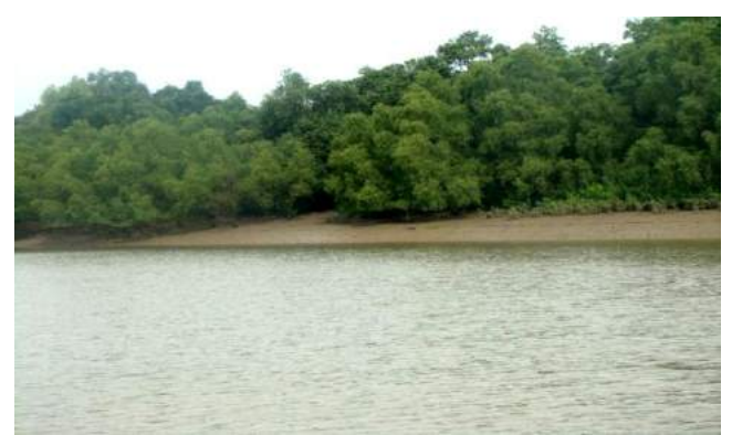
Fig. 1. Bhitarkanika island

The present article reports the occurrence of strychnine tree, Strychnos nux-vomica L. (family Loganiaceae) in Bhitarkanika National Park, Rajnagar (Mangrove) Forest Division, Kendrapara, Odisha.