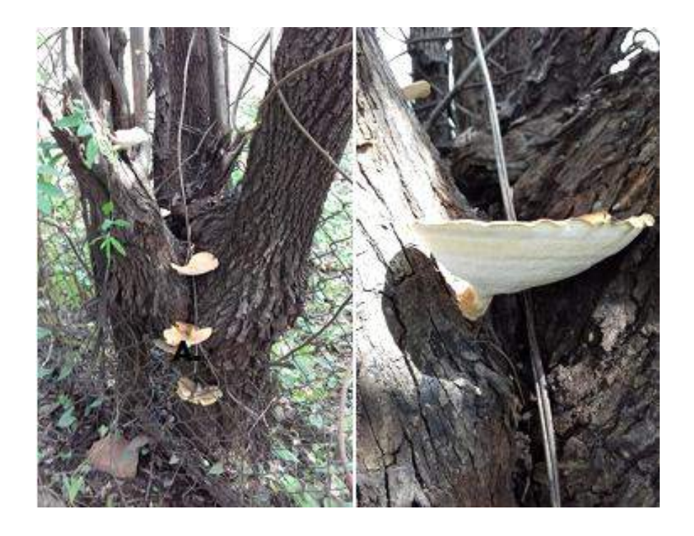
Fig. 1. Polyporus grammocephalus on Ziziphus jujuba, habit and close view of fruit body

Young T, Smith K (2005). A field guide to the fungi of Australia. University of New South Wales Press.