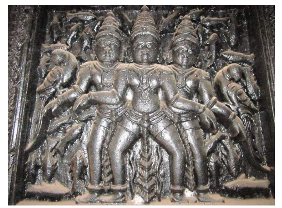
Pillar sculptures in Chowta palace

In this background, one has to look to the vast number wooden antiques in the country. There are few significant wood works such as the Padmanabhapuram palace in Kerala, Chowta palace in Mangalore and many more.