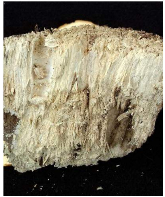
Fig. 4. Polyporus grammocephalus causing white rot in wood of Ziziphus jujuba,