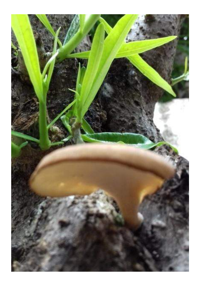
Fig. 3. Polyporus grammocephalus fruit body on Nerium odorum