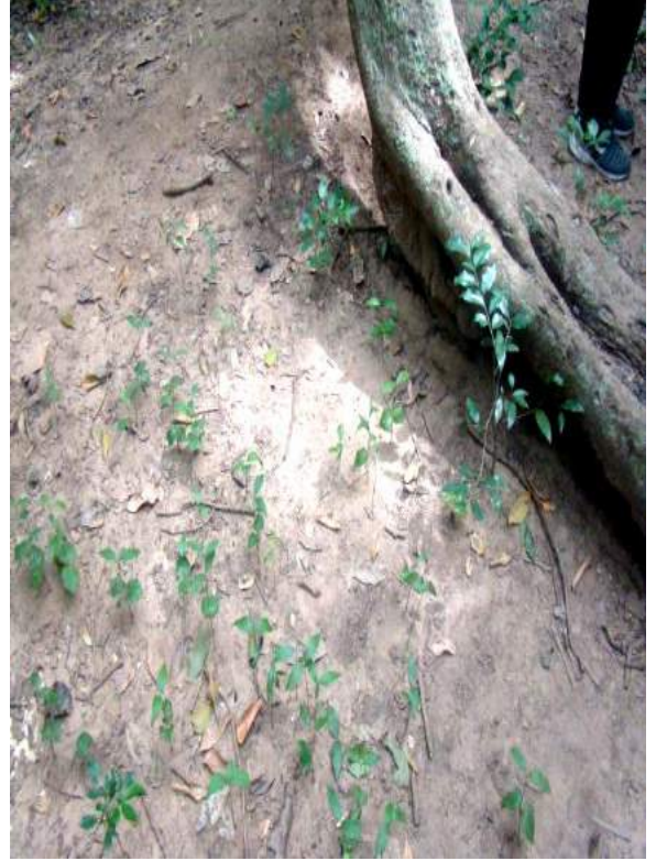
Fig.3. Germination of S. nux-vomica in Bhitarkanika island

also seen in South East Asia, Myanmar, Sri Lanka and Northern Australia. The plant grows well in dry, humid, late-rite, sandy and alluvial soil. It grows up to 50ft in height.