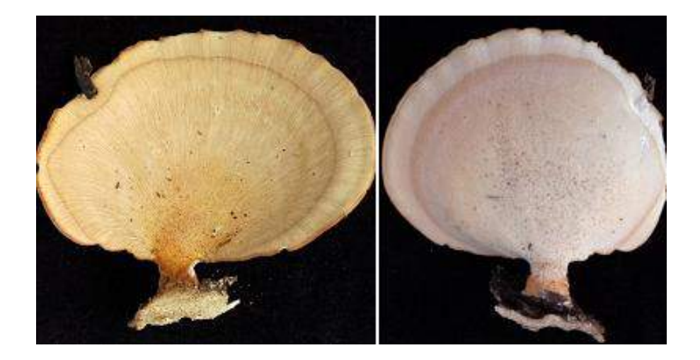
Fig. 2. Polyporus grammocephalus on Ziziphus jujube, sporophore dorsal and pore surface