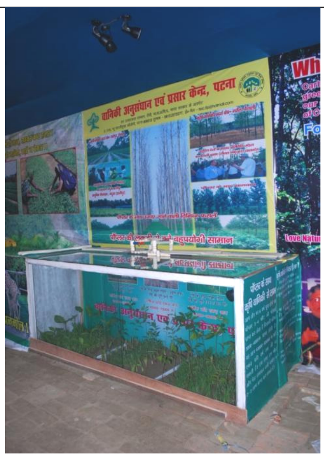
FREC, Patna demonstrating Poplar based Agroforestry models and its various activities.