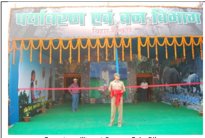
Forest pavilion at Sonpur Fair, Bihar