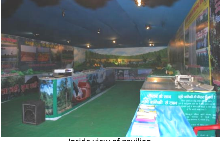
Inside view of pavilion