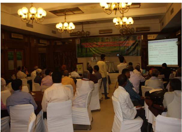
Delegates at the workshop