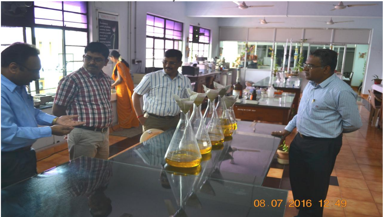
Research team of M/S. Varsha Bioscience Technology India Pvt.Ltd, Hyderabad visit to Division of Bioprospecting