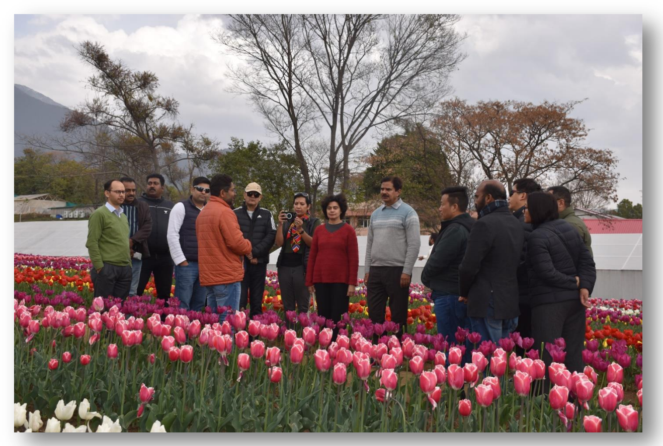
Visit to Tulip Garden, CSIR-IHBT Palampur during field visit