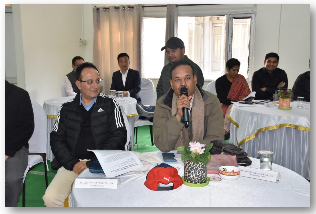
Participants giving their feedback