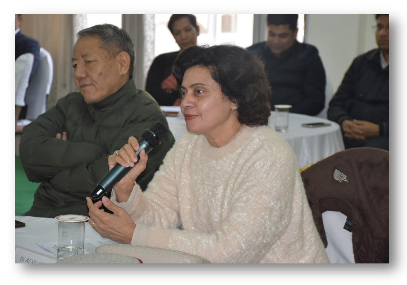
Participants giving their feedback