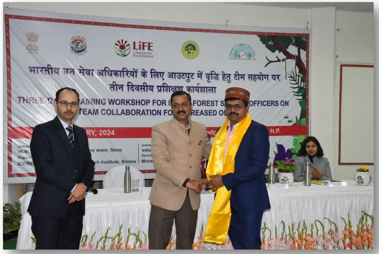
Welcome of the participants in customary Himachali tradition