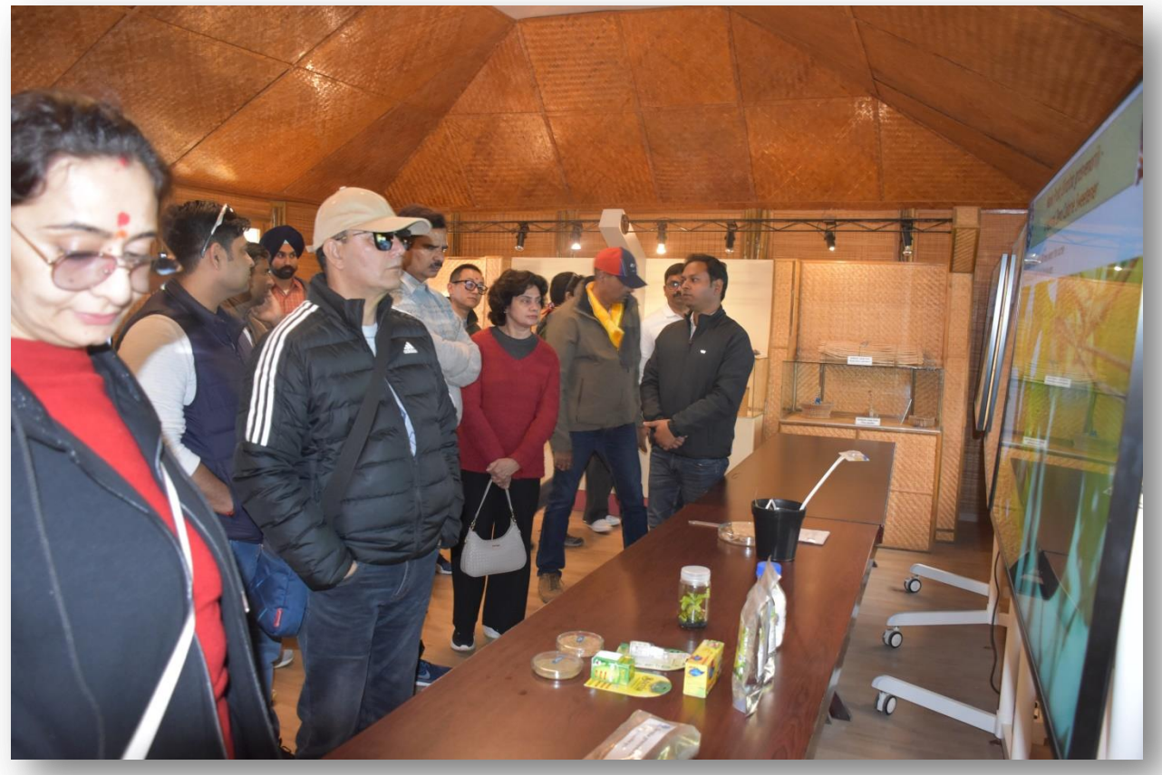
Visit to Bamboo museum, CSIR-IHBT Palampur during field visit