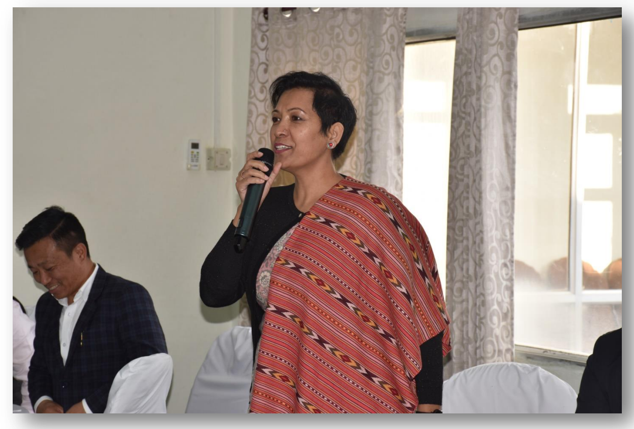
Participant giving her feedback