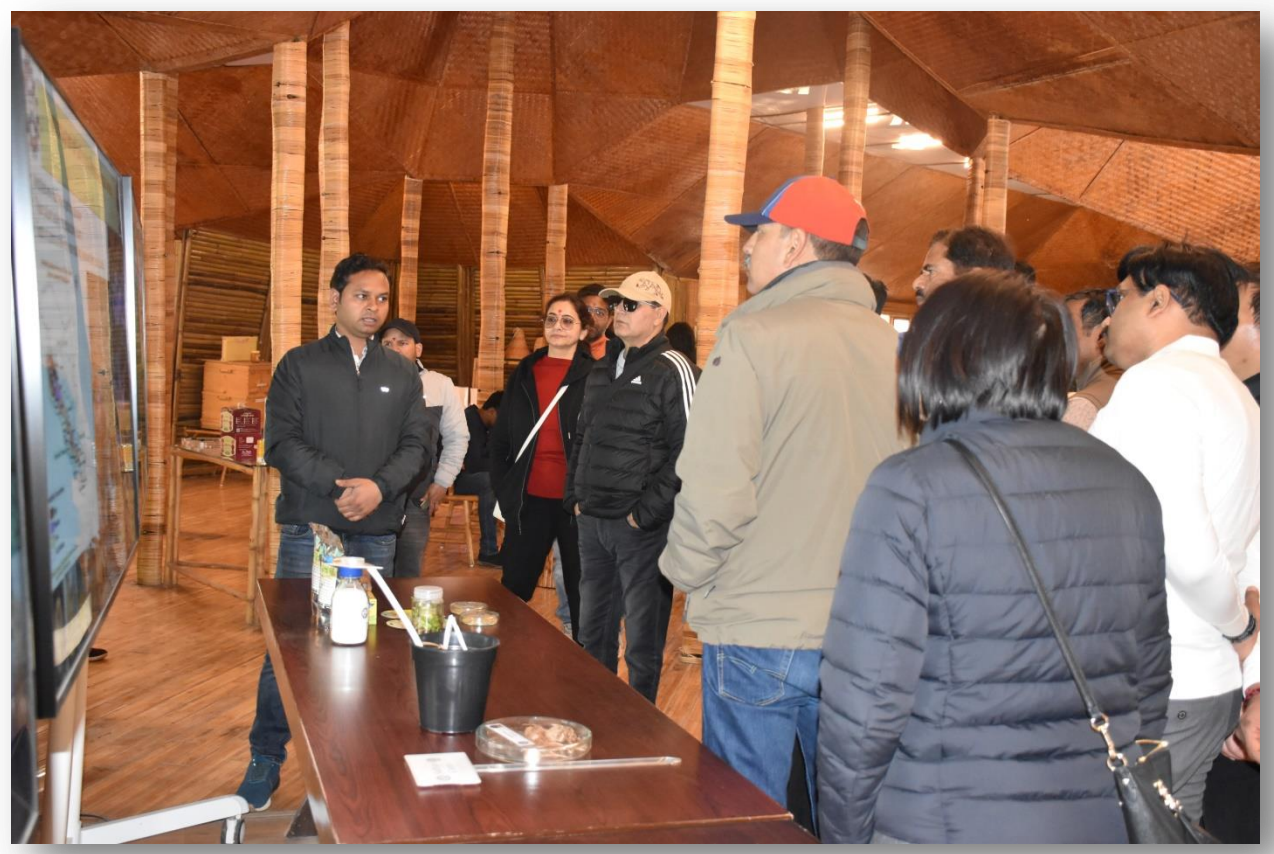
Visit to Bamboo museum, CSIR-IHBT Palampur during field visit