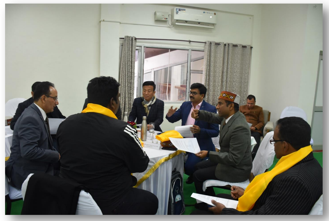
Group discussion by the participants during technical session