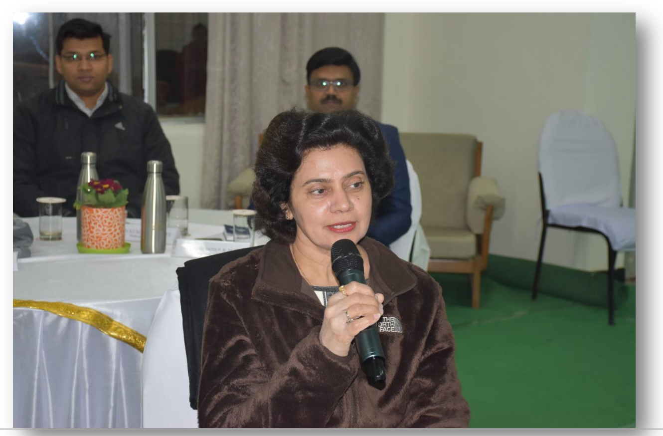
Introduction by the participants during Inaugural session