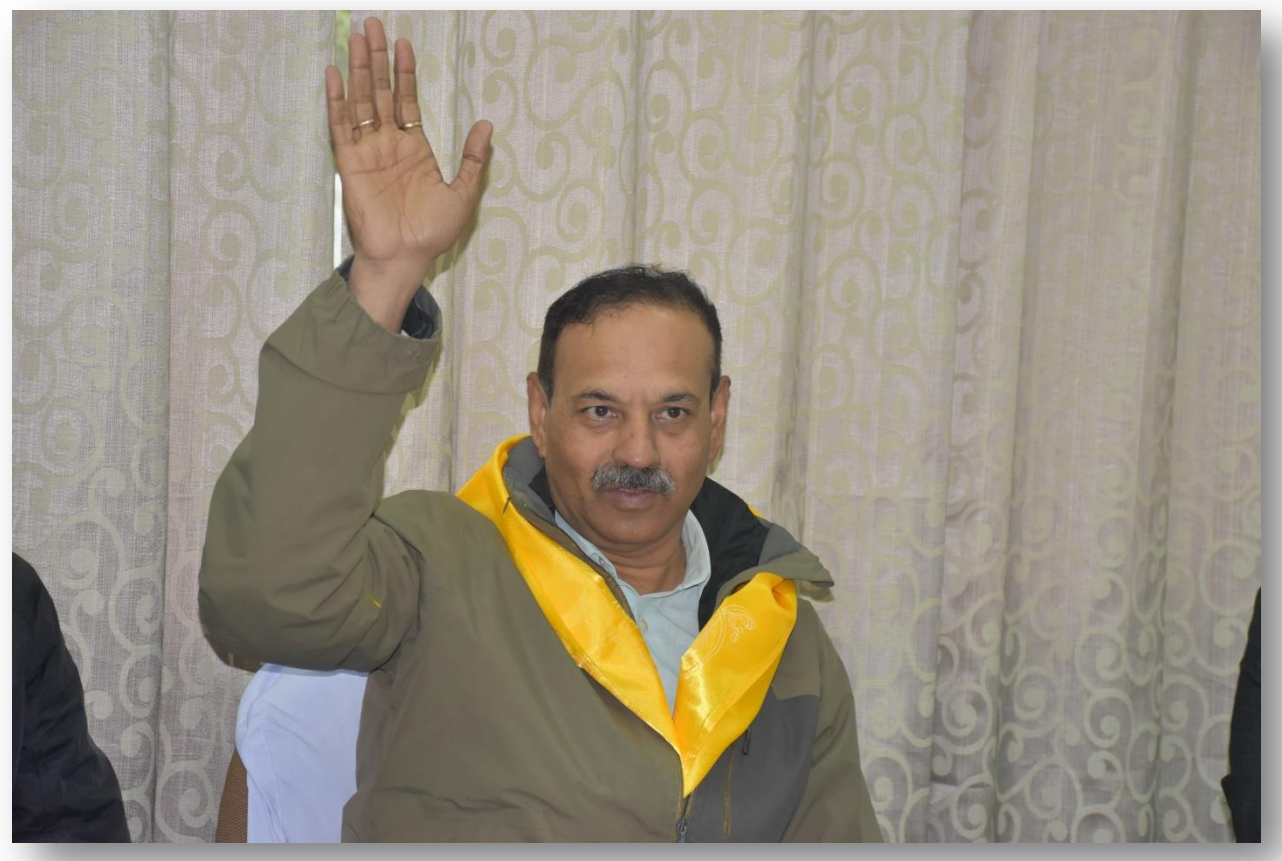
Participant making a point during the technical session