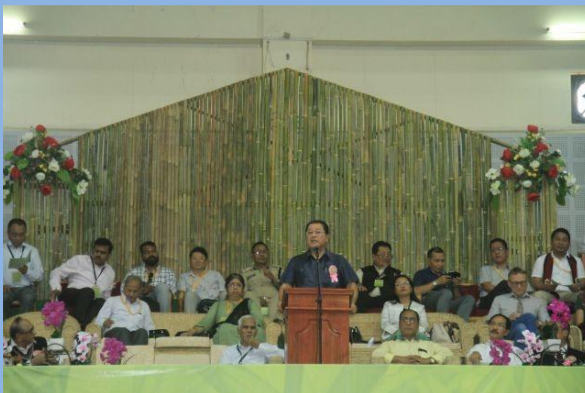
Chief guest, Shri Lal Thanhawla, Hon'ble Chief Minister & Minister EF&CC