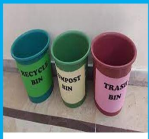
Conserve natural resources