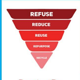
Practice 5Rs Wisely dispose waste