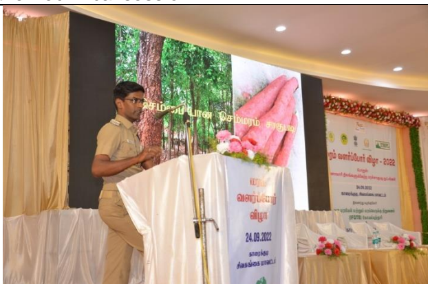
Subject Experts during the Technical session