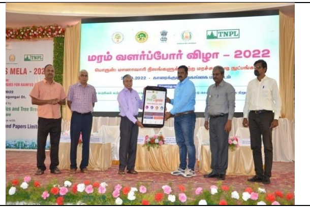
New Release – "TreeGenie iOS" Mobile application