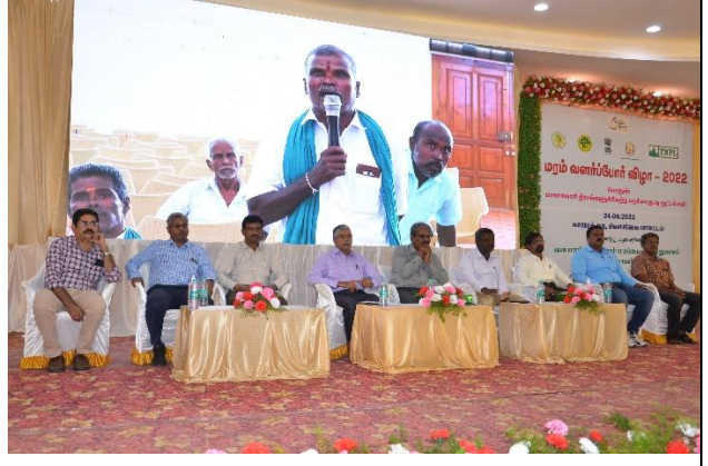
Farmers interaction during the panel discussion