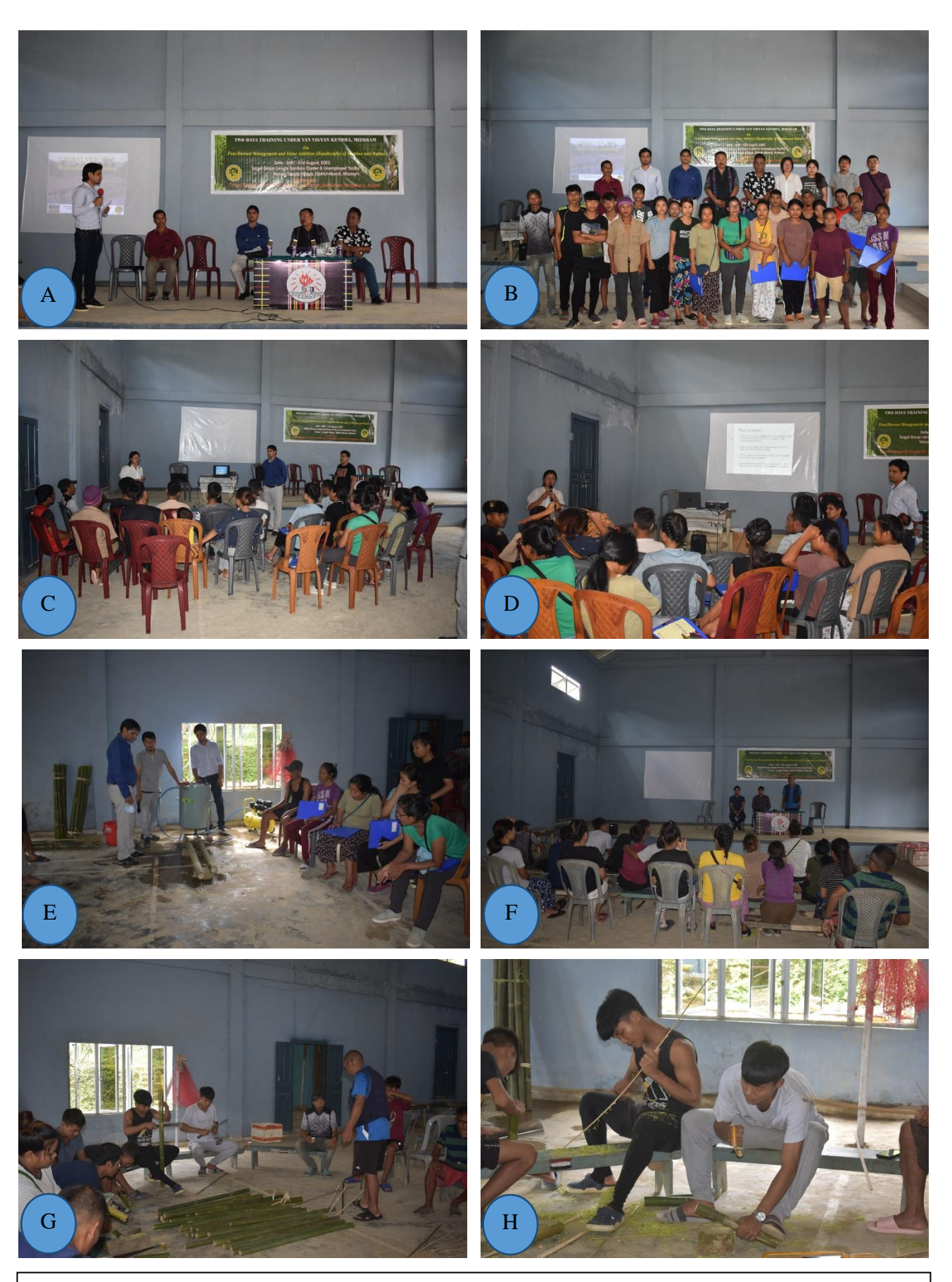
Figure 2: A: Vote of Thanks B. Group Photograph C-D PresentationsE. Demonstration ofBoucheri AppartusF-H Hands on Training on Bamboo & Rattan Handicrafts