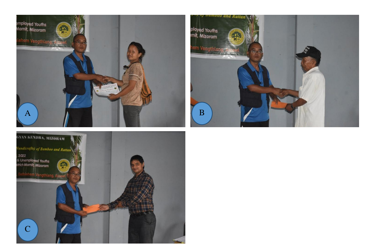
Figure 6: A-B: Distribution of Certificates. C. Handing over of Honorarium to the Master Trainer