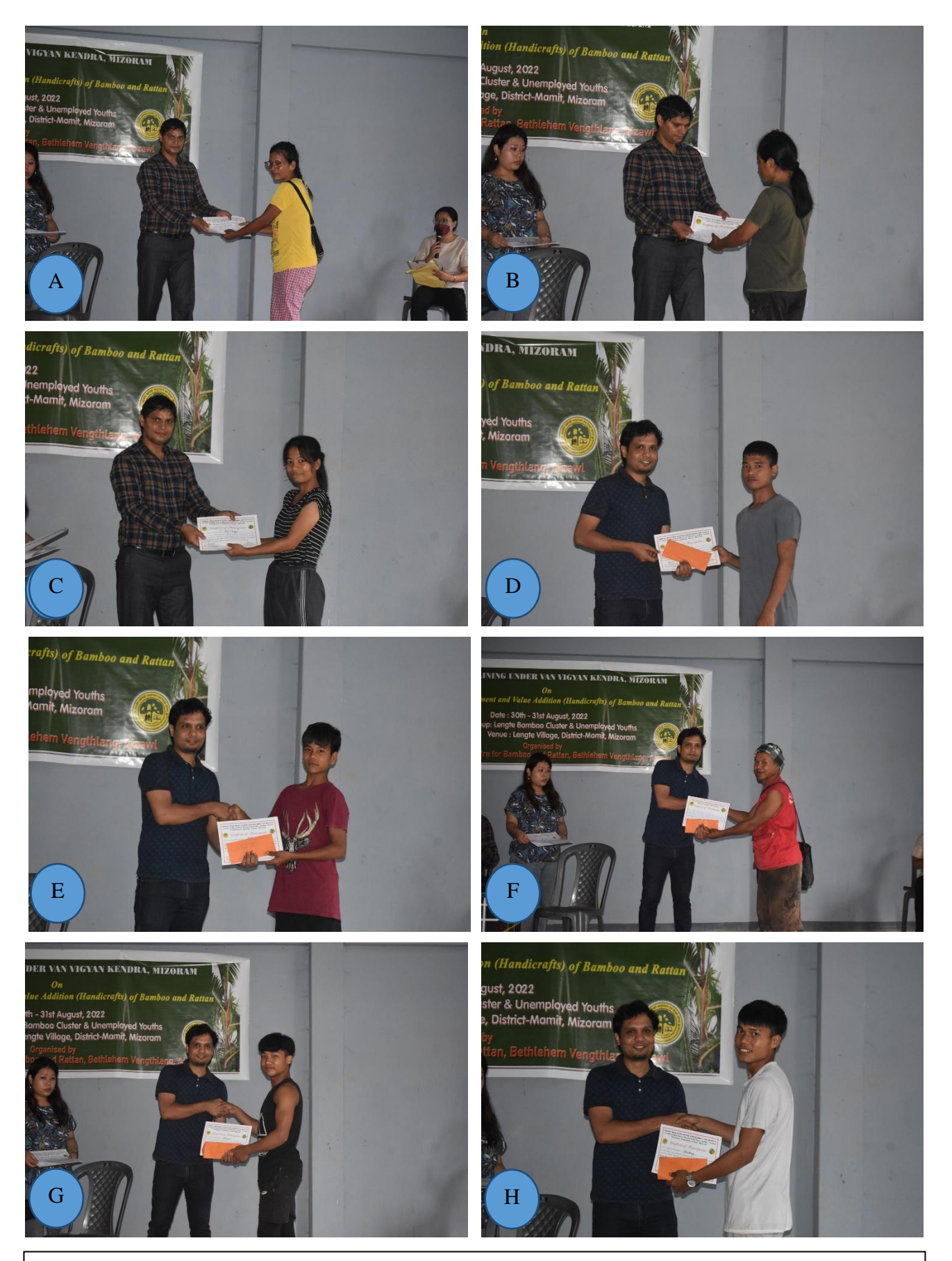
Figure 4: A-H: Valedictory Session and Distribution of Certificates to the trainees