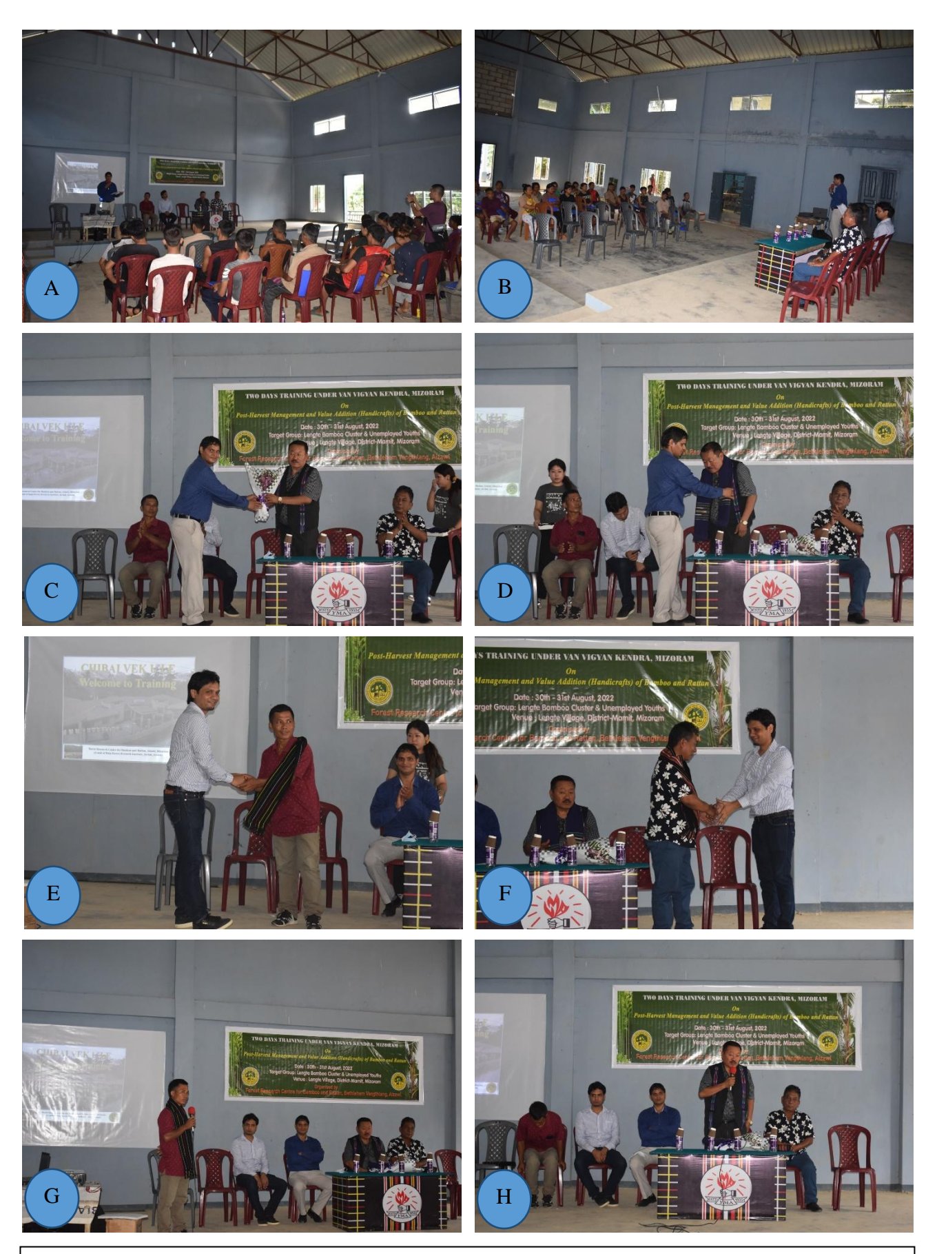
Figure 1: A & B: Welcome Address C-F: Felicitation of Guests G-H: Speech by Guests.