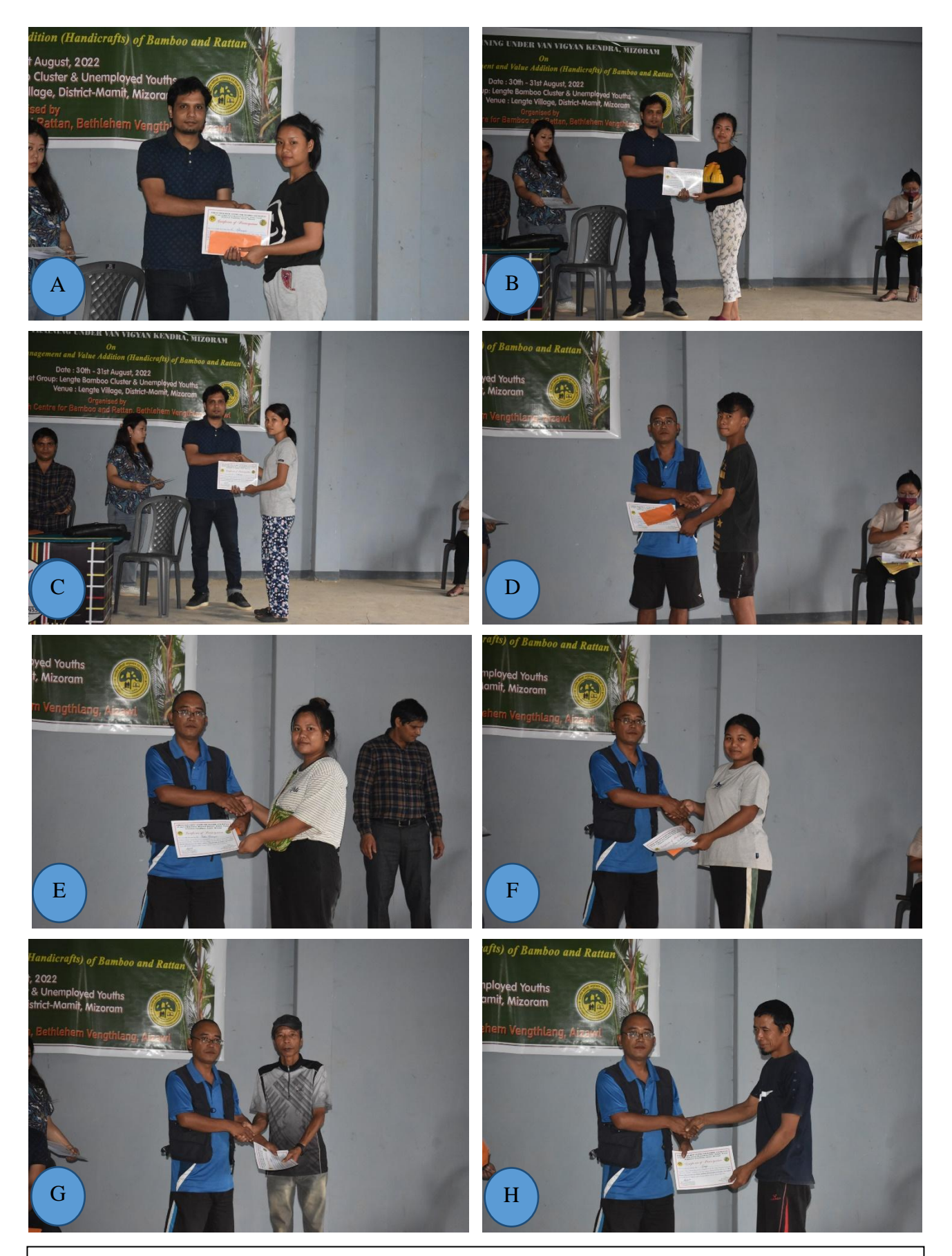
Figure 5: A-H: Valedictory Session and Distribution of Certificates