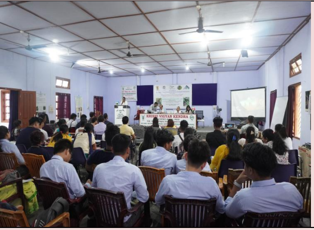
The crowd on the day of workshop.