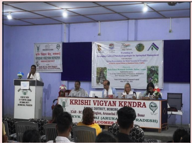
Dignitaries on the Dais of the opening session