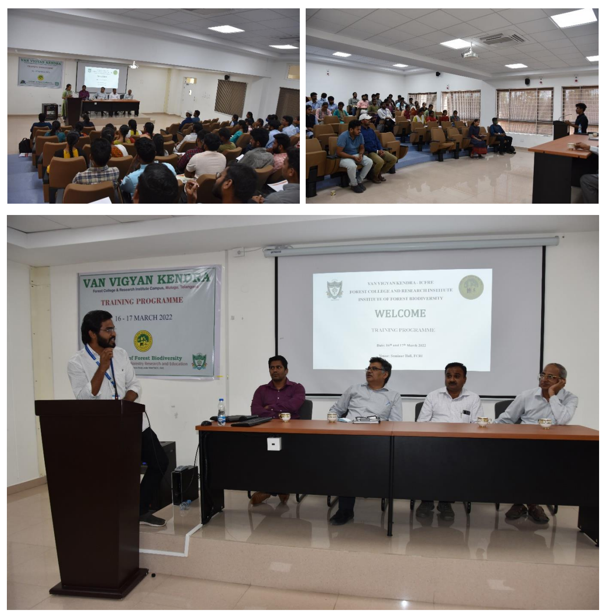
Photos 19 - 21: Students sharing their experiences and giving feedback about the training programme