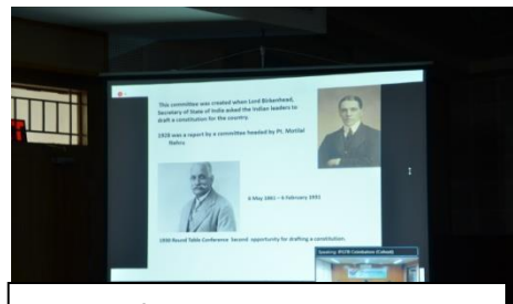
A part of the Presentation