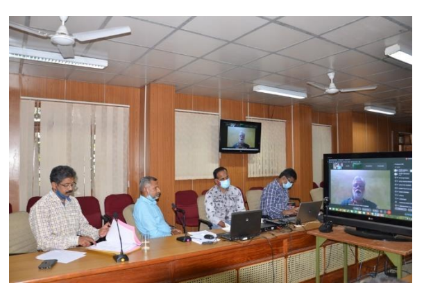
Online interaction during the lecture