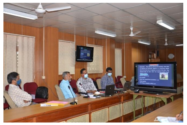
A view of training course lecturesession

A panel discussion on "Prevention, control and management of invasive alien species" was organized on 6<sup>th</sup> August 2021. Dr N. Krishnakumar, PCCF (Retd.), Tamil Nadu State Forest Department chaired the panel discussion and all the resource persons along with the participants interacted during the discussion. The training programme was concluded on 6<sup>th</sup> August 2021 with valedictory function.