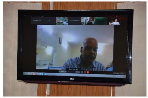
Inaugural Address by DDG (Extension), ICFRE