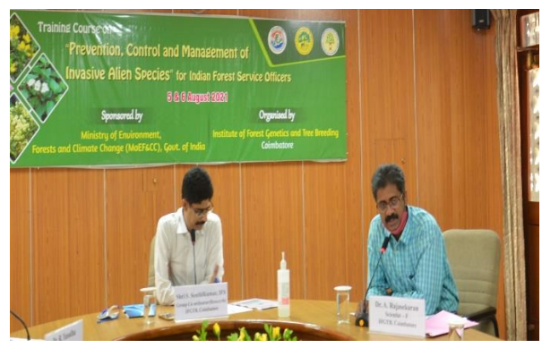
A view of Valedictory session