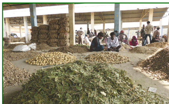
Medicinal Plants in India: An Assessment of their Demand and Supply

The herbal based health care and wellness sector in India, witnessing a steady growth over the years, is poised to grow further. The herbal industry in the country is also gearing up and undergoing a makeover to both trigger and take benefit from this growth. The medicinal plant resources, wild collected or cultivated, forming base for the growth of herbal sector, are experiencing a high demand, giving rise to concerns about the sustainability of herbal raw drugs supply. Moreover, there always have been concerns about the diversity and identity of the herbal raw drugs in trade. This publication, brought out by the Indian Council of Forestry Research & Education as an outcome of an assignment entrusted to it by the National Medicinal Plants Board, Ministry of AYUSH, Government of India, addresses many of these concerns. A result of extensive field visits, interactions with experts and stakeholders, and literature review, the publication enlists 1178 medicinal plant species forming source of 1622 botanicals recorded in trade. Total commercial demand of herbal raw drugs in the country estimated as 5,12,000 MT for the year 2014-15, is projected to grow to 6,50,000 MT by 2020. The publication also